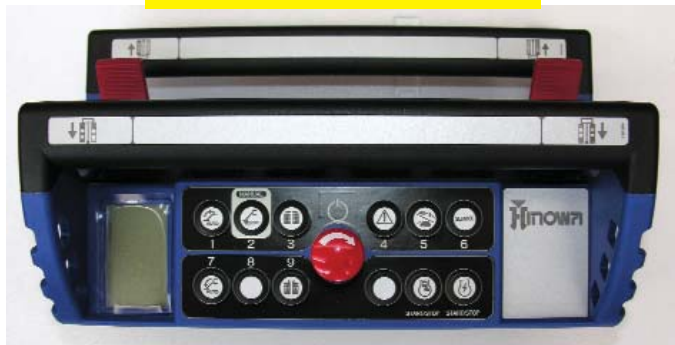
NEW RADIO CONTROL

The battery charger of the remote control is aboard machine in a protected place, the remote control is equipped with 2 batteries and preserves the possibility to be connected to the GoldLift through cable and to be used as wire-control.